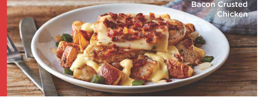
All entrées are served with choice of one: